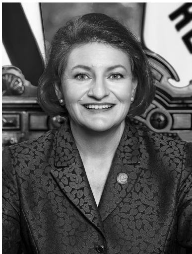
TONI G. ATKINS PRESIDENT PRO TEMPORE OF THE SENATE