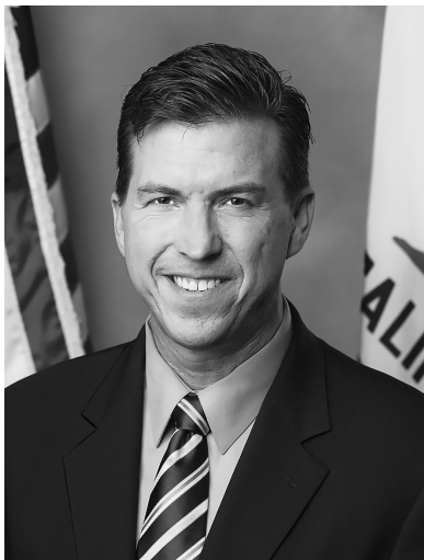
KEVIN MULLIN SPEAKER PRO TEMPORE OF THE ASSEMBLY