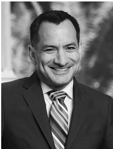
ANTHONY RENDON SPEAKER OF THE ASSEMBLY