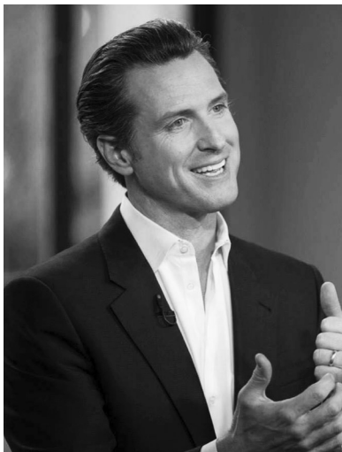
GAVIN NEWSOM GOVERNOR OF CALIFORNIA