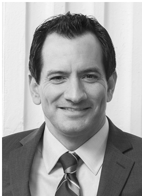
ANTHONY RENDON SPEAKER

RENDON , Anthony (D) 63rd District. Elected to the Assembly 2012. Sworn in as the 70th Speaker March 7, 2016. In 2017, Rendon led a progressive and productive legislative session during which the Assembly passed a landmark $52 billion transportation funding plan and legislation to address the affordable housing crisis. In 2016, the Assembly passed the nation's first $15 minimum wage, extension of California's climate change reduction goals, overtime pay for farmworkers, and groundbreaking policies on gun and tobacco use. Rendon promotes environmental and economic equity for disadvantaged communities like the one he represents, and has supported local culture to preserve community integrity. Recent laws under his leadership include police use-of-force reform, free universal pre-kindergarten, historic investment in California's students, clean lending laws, increased affordable housing production, and water quality aid for communities in need. Prior to serving in the Assembly, Rendon was an educator, non-profit executive director, and environmental activist. He attended Cerritos Community College and California State University, Fullerton and earned a Ph.D. from the University of California, Riverside. He resides in Lakewood with his wife, Annie, and daughter, Vienna.