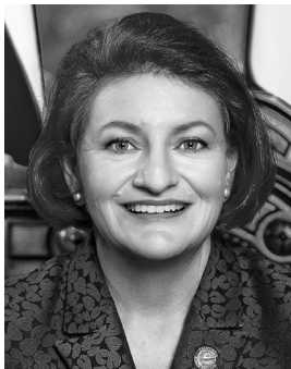
TONI G. ATKINS