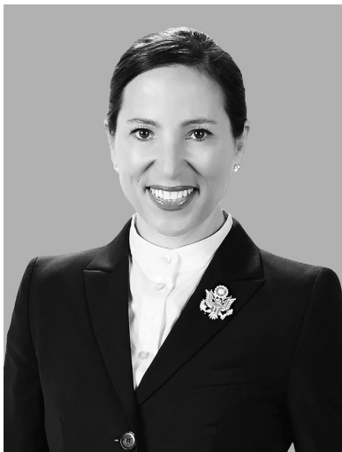
ELENI KOUNALAKIS LIEUTENANT GOVERNOR